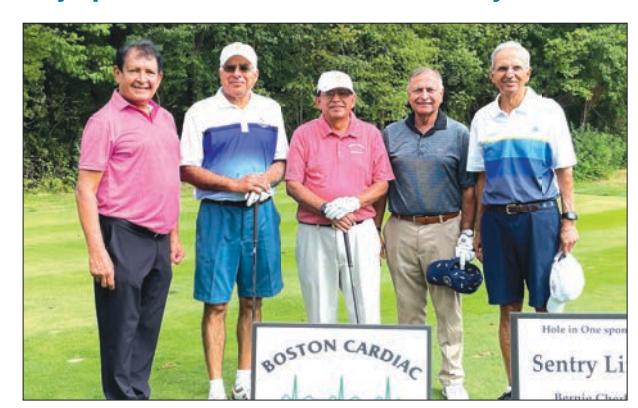
We greatly appreciate all of our donors.

Charity Sponsor - $500 Tournament Player - $350